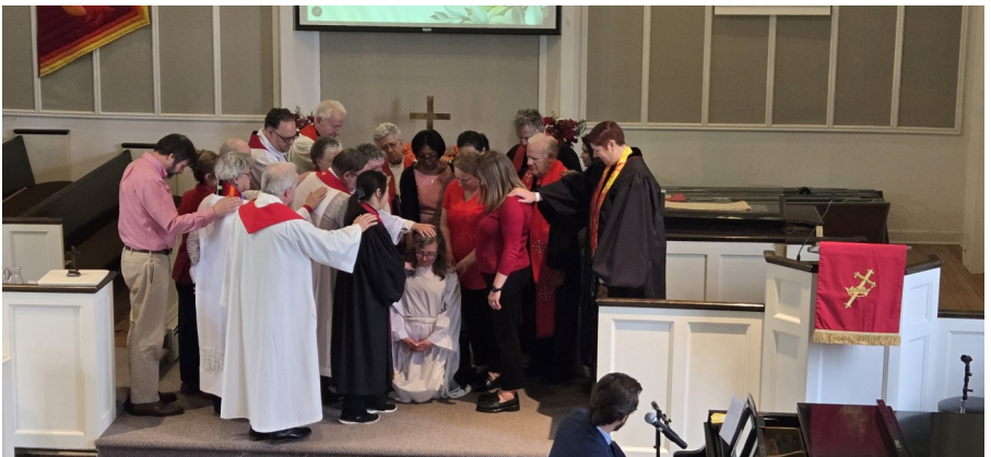
TOP: The congregation. MIDDLE: The clergy and congregation. BOTTOM: Laying on of hands.